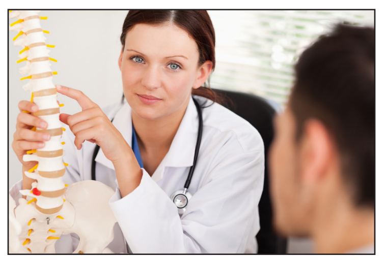
This requirement is further discussed in MLN Matters <sup>®</sup> article MM8401 available at http://www.cms.gov/Outreachand-Education/Medicare-Learning-Network-MLN/MLNMattersArticles/Downloads/MM8401.pdf .

Also, remember that you must submit the numeric, eightdigit clinical trial identifier number in the electronic 837P in Loop 2300 REF02 (REF01=P4) or preceded by "CT" when placed in Field 19 of paper claim form CMS-1500.